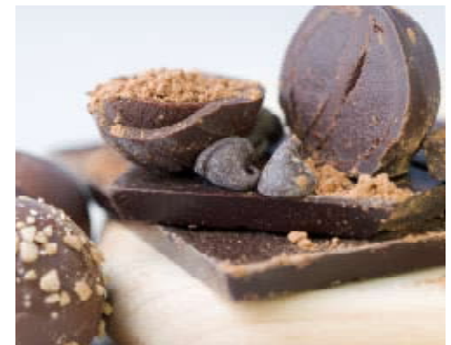
Print and Internet Marketing