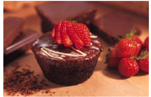
Annual Meeting and Convention