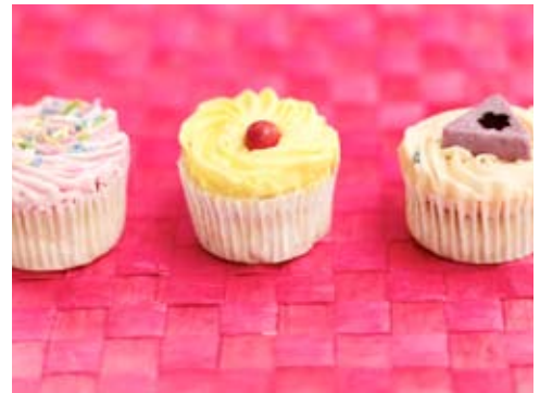
Special Events/Unique Markets