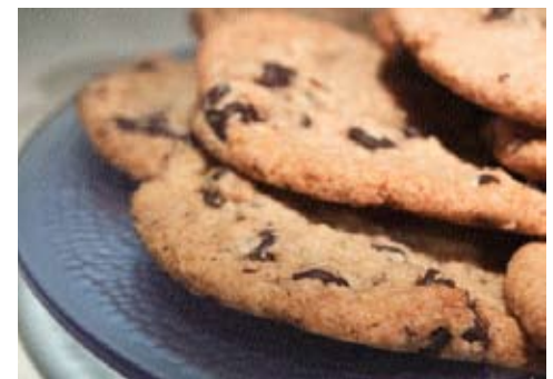
Continuing Education Sponsorship